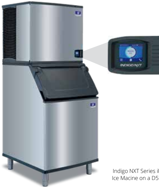
Indigo NXT Series iF0900 Ice Machine on a D570 Bin

Designed for operators who know that ice is critical to their business, the Indigo ® NXT Series ice machine's preventative diagnostics continually monitor itself for reliable ice production. Improvements in cleanability and programmability make your ice machine easy to own and less expensive to operate.